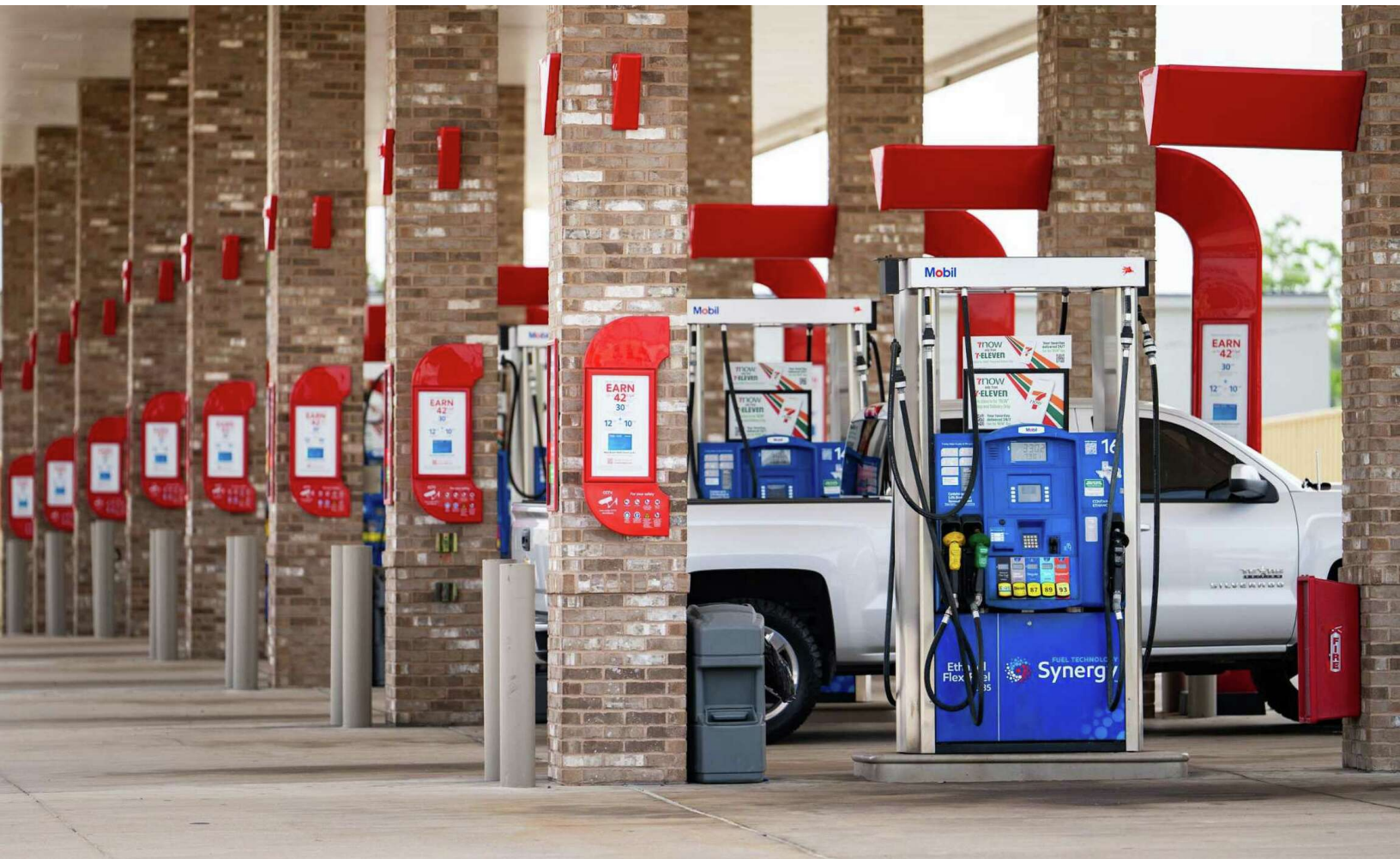
Gas pumps are lined up, Wednesday, June 15, 2022, in Houston.

Democratic lawmakers on Tuesday sought a suspension of Texas' gasoline tax , citing the